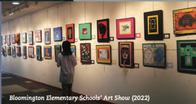
Bloomington Elementary Schools' Art Show (2022)

1800 West Old Shakopee Road Bloomington Center for the Arts 2nd Floor