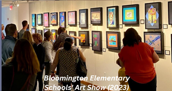
Bloomington Elementary Schools' Art Show (2023)

1800 West Old Shakopee Road Bloomington Center for the Arts 2nd Floor