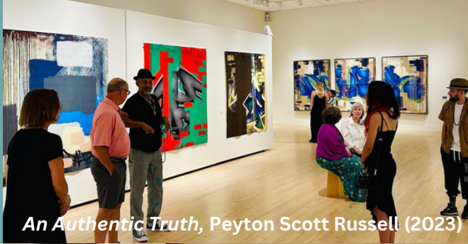
An Authentic Truth, Peyton Scott Russell (2023)

1800 West Old Shakopee Road Bloomington Center for the Arts Main Floor